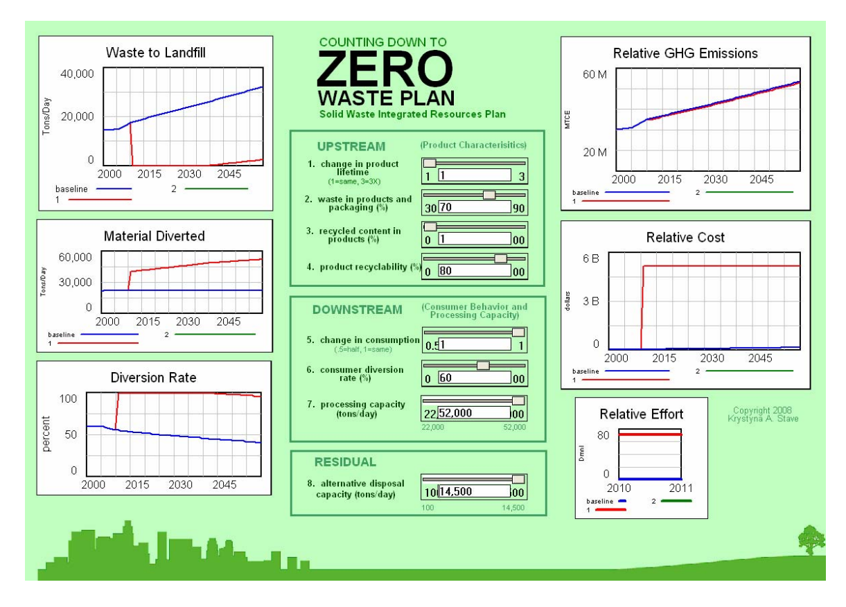
Figure 4. Zero Waste by increasing processing capacity

So is the Zero Waste goal even possible? If so, how could it be achieved? Figures 4 and 5 show two possible scenarios. Figure 4 represents an emphasis on downstream technology, increasing processing and alternative disposal capacity to their maximum values. Waste does decrease to zero<sup>1</sup> as soon as the capacity comes on line, although it begins to increase eventually. (It can be kept at zero with other measures including increasing the consumer diversion rate, increasing product lifetime, decreasing waste in products, or decreasing consumption.)