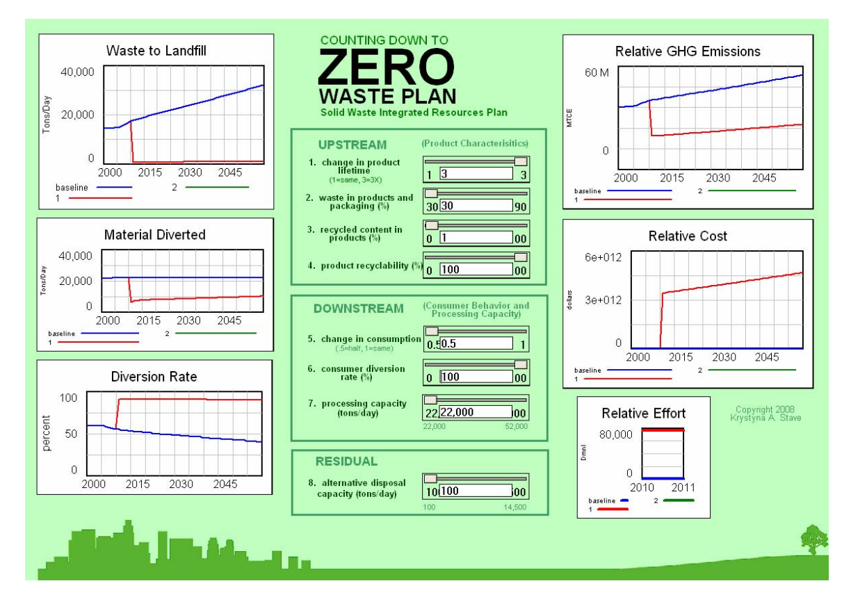
Figure 5. Zero Waste by changing consumer behavior and product characteristics

the behavioral and product characteristics solution cuts greenhouse gas emissions almost in half relative to the baseline conditions.