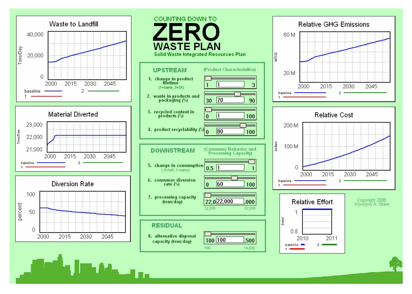
Figure 3. User Interface of Zero Waste Model

Figure 3 shows the user interface of the Zero Waste Model (version 2_22). The eight strategic leverage points with their initial values are shown in the center of the screen.