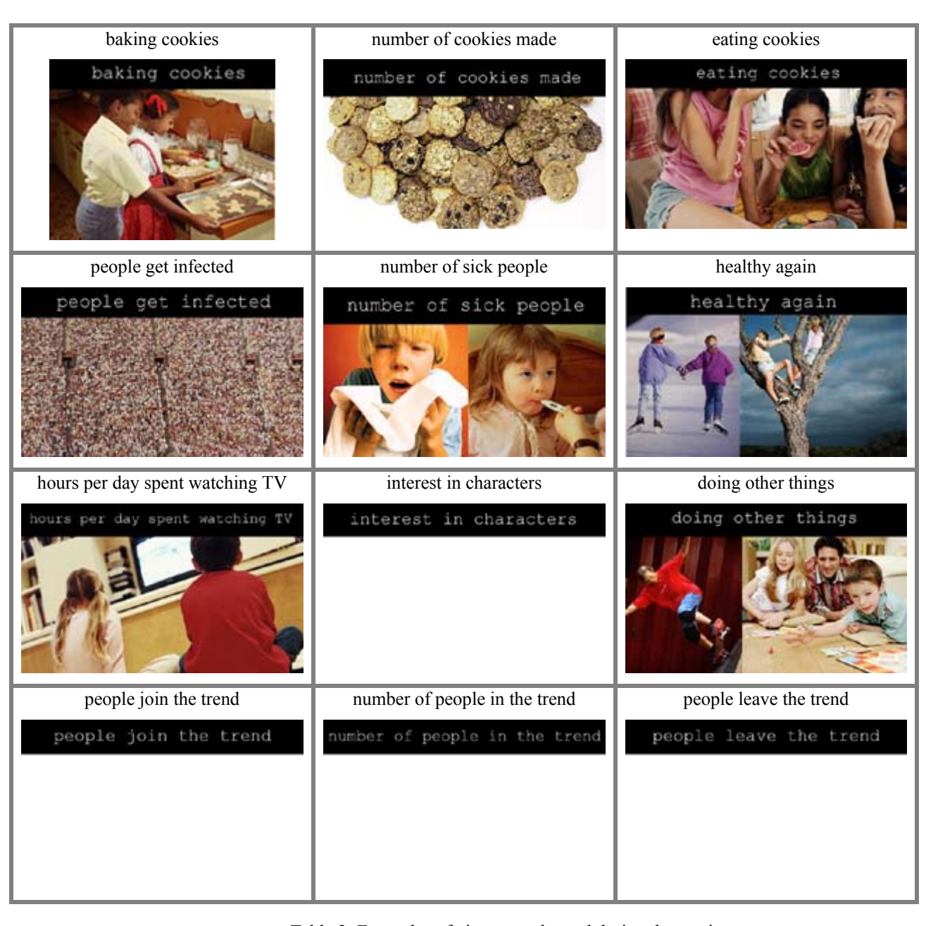
Table 2: Examples of picture cards used during the sessions