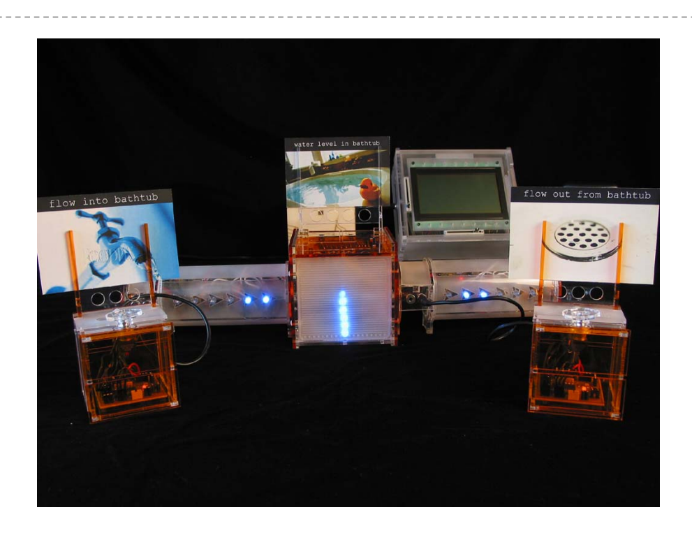
Figure 1. System Blocks simulating water flow through a bathtub

on modeling and simulation tool (Zuckerman & Resnick 2003). System Blocks were designed to provide an easier introduction to systems modeling and simulation. The blocks are physical, with knobs that enable real-time interaction with a running simulation. The dynamic behavior is represented using different mediums, including moving lights, sound, and a line graph. Special attention was given to create an "equation-less" modeling process, to prevent possible barriers to learning equations might cause.